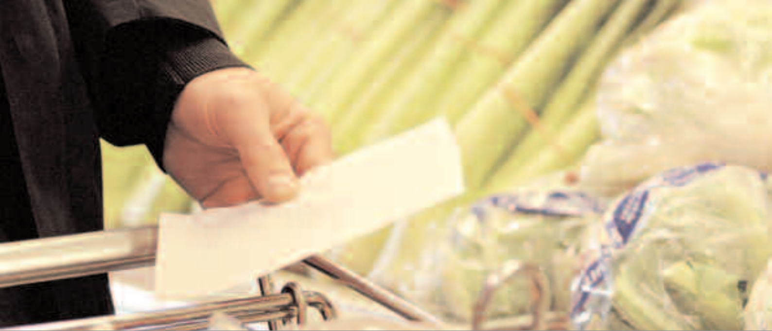
DigiPoS Store Solutions: Grocery stores